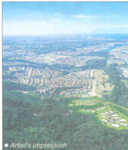
● Artist's impression

The Jacaranda will feature 66 villas on 8.5ha of sloping lots offering views overlooking the Gold Coast