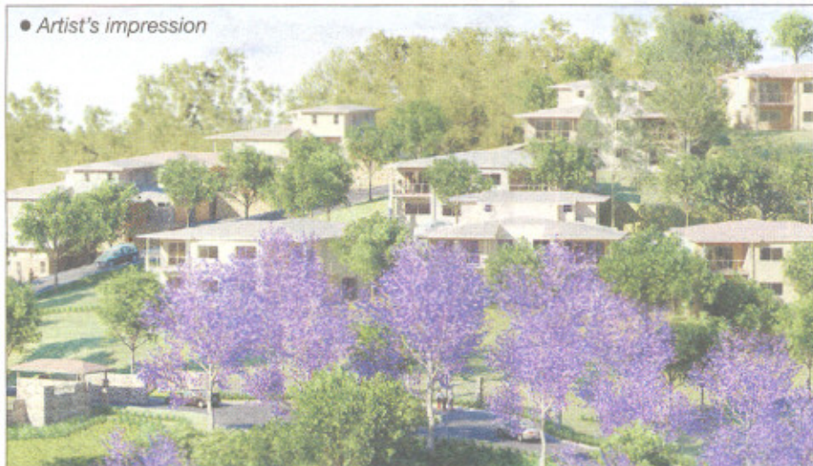
● Artist's impression